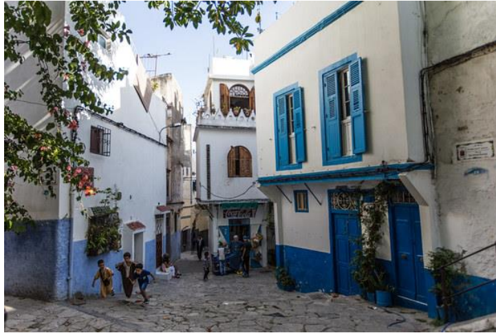
Street scene in the Madinah