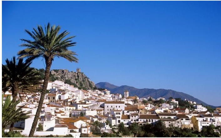
Gaucin, Serrania de Ronda

We will meet you at Gibraltar Airport at 15.30pm and take you by private coach to the beautiful pueblo blanco (white village) of Gaucin, where you will spend your first two days in a lovely villa. This spectacular mountain village, with its views all the way to distant Gibraltar, and the Rif mountains in Morocco, is home to over twenty artists' studios.