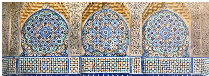
Mosaics in the Madinah, Tangiers

After an early breakfast the coach will take us to Tarifa. From there we will catch the ferry across the straights of Gibraltar to Tangiers, where we will stay at El Minzah Hotel near the old Madinah. This beautiful building with its Arabesque woodwork, oriental carpets, arched doorways and large Andalusian patio in the heart of the hotel, was built by the 4 th Marquis of Bute in the early 20 th Century, in a pure Hispano-Moorish style that is true to the architectural heritage of Morocco, whilst embodying all the comfort of an English gentleman's club.