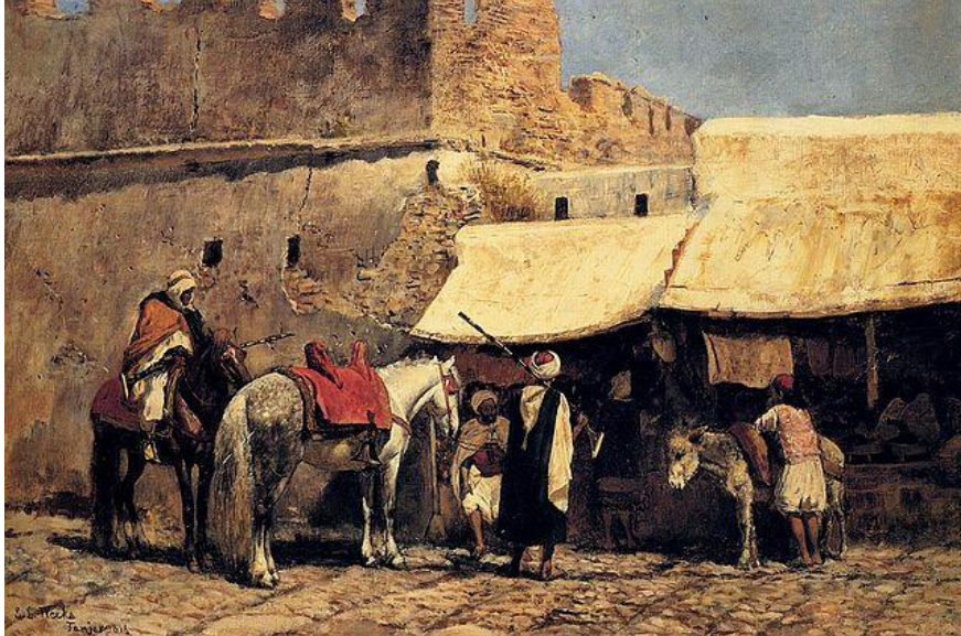
Tangiers. 1878. Edwin Lord Weeks.

Because of its strategically important location, Tangiers has a fascinating and varied history, beginning with its origins as a Phoenician trading post, through Carthaginian, Roman and Byzantine colonisation; native Berber involvement in the Islamic kingdom of Al-Andalus and its role as the eventual refuge for many of the Moors who were driven out of Spain following the Christian ‘reconquest’.