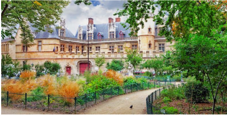
Musée de Cluny

We begin our Paris tour in this 15 th Century building, with its fine collection of artifacts from the Gallo-Roman until the 16 th Century, including pieces from the Byzantine and Islamic eras of the Middle Ages. This Medieval 'hotel', built over an impressive Roman baths, was formerly the Paris residence of the powerful Abbots of the highly influential monastery of Cluny. There will be time during the tour for an optional coffee break.